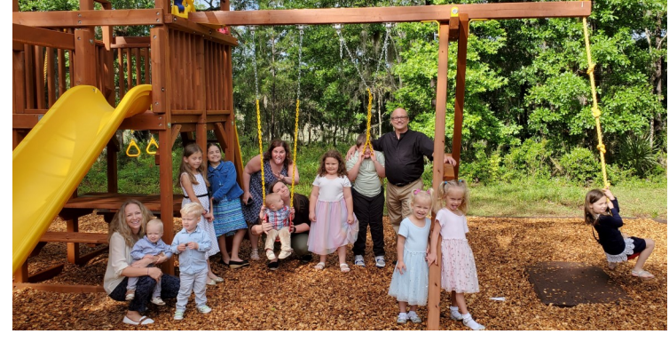
Children at the new playground dedication. Family time is now being held at the church playground on the second Tuesday of each month.